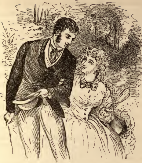
“Lillie was leaning confidentially on John’s arm.”

wonderful boldness, and at the grace of the fair entertainer.